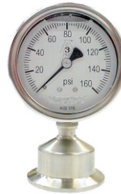
Property of Clear Lake Filtration Proprietary and Confidential.

Removable bezel for easy calibration and repair.